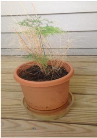
Fern, August 2013