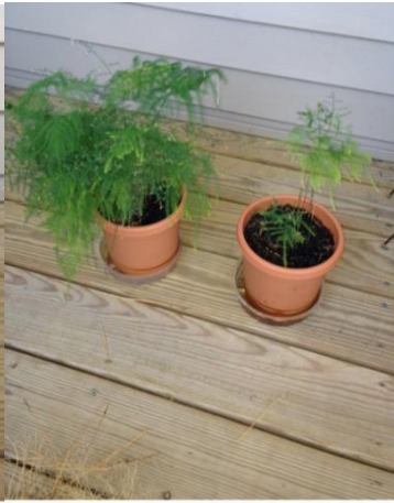
On right, October 2013