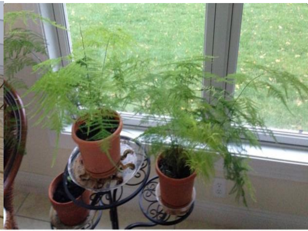
On right, October 2014