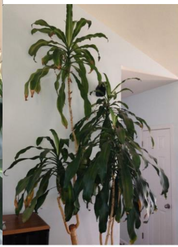
Corn plant, August 2013