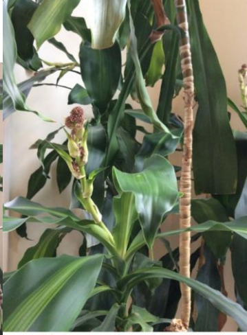
In bloom, October 2014